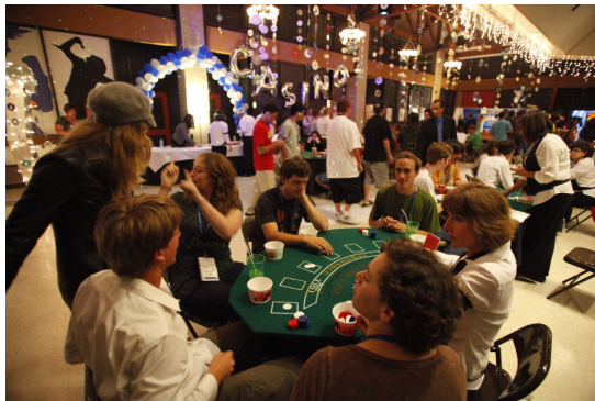
The Grad Night casino, shown here in 2009, is always a popular activity.